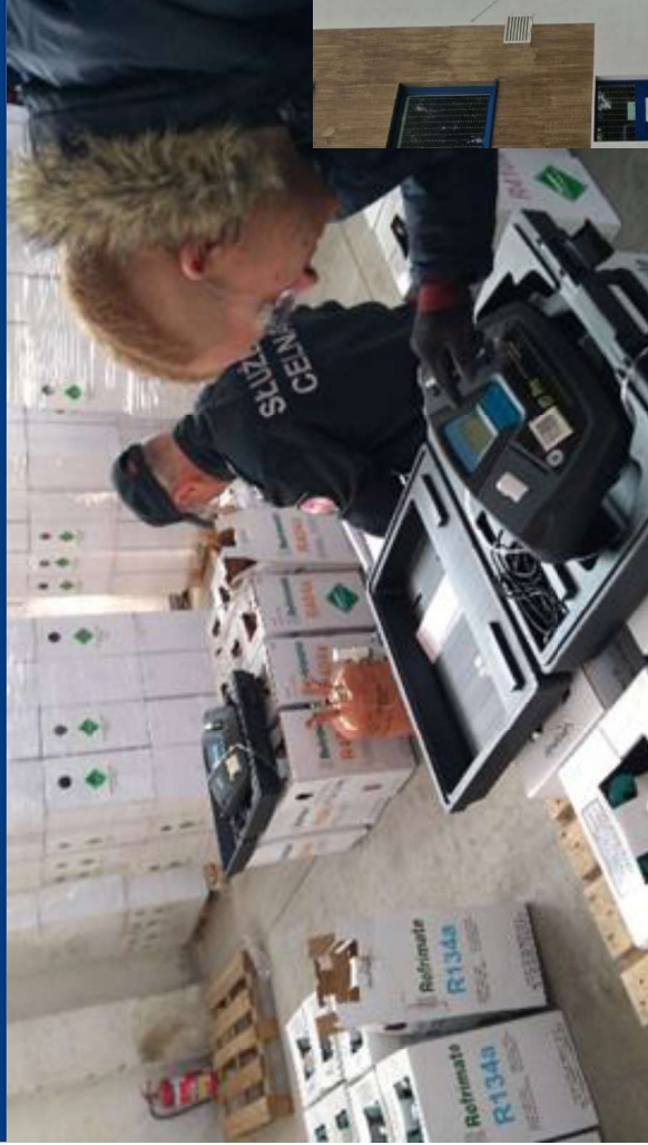
25 tons of illegal refrigerant seized in Łódź, 2019