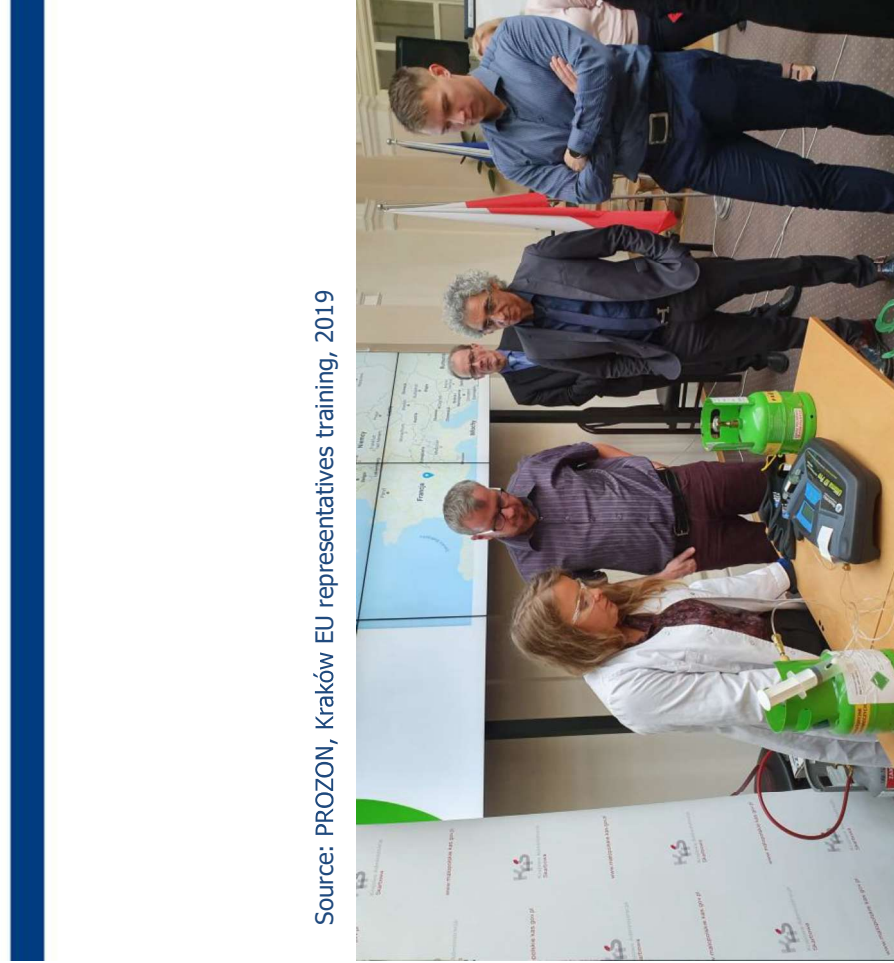
Kraków EU representatives training, 2019